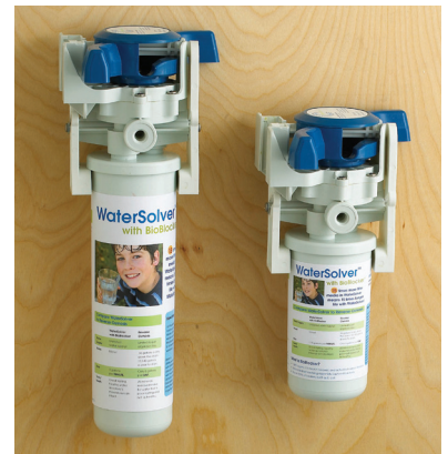
Point of Use Filters