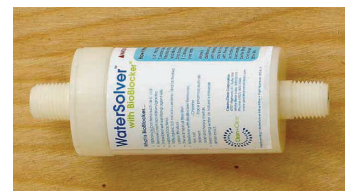
In-Line Water Solver Filter