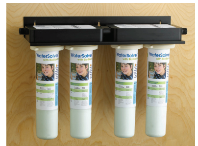
Point of Entry Systems